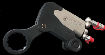
CLOSED SPANNER WRENCH