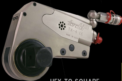
HEX TO SQUARE DRIVE ADAPTOR