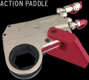
LOW POINT REACTION PADDLE

FLAT - ACCESS THE INACCESSIBLE PROVEN - USED ON JOB-SITES WORLDWIDE SUPERIOR - AIRCRAFT QUALITY ALLOY