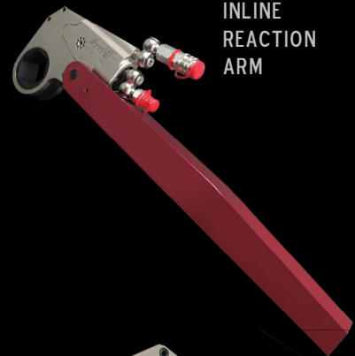
INLINE REACTION ARM